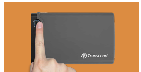
One touch for easy backup

*SSD Scope is available for system clone.