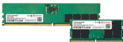
Unbuffered Long-DIMM / Unbuffered SO-DIMM