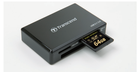
Perfectly works with the Transcend's RDF9 USB 3.1/3.0 UHS-II card reader